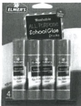
Washable School Glue