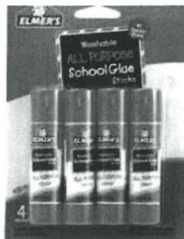
Elmer's Washable School Glue